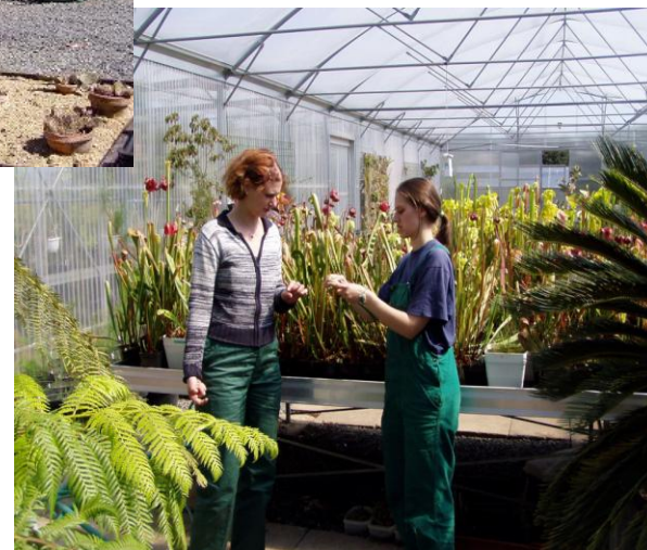
Social Firm Zahrada