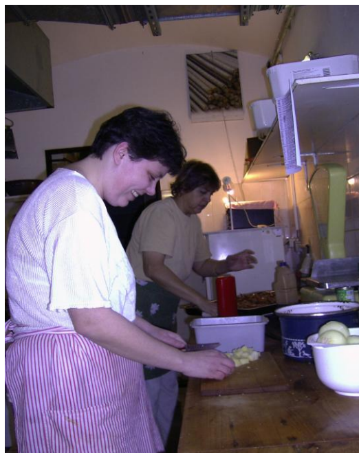
Social Firm Jůnův statek and Social Firm Laundry U Mandelíků