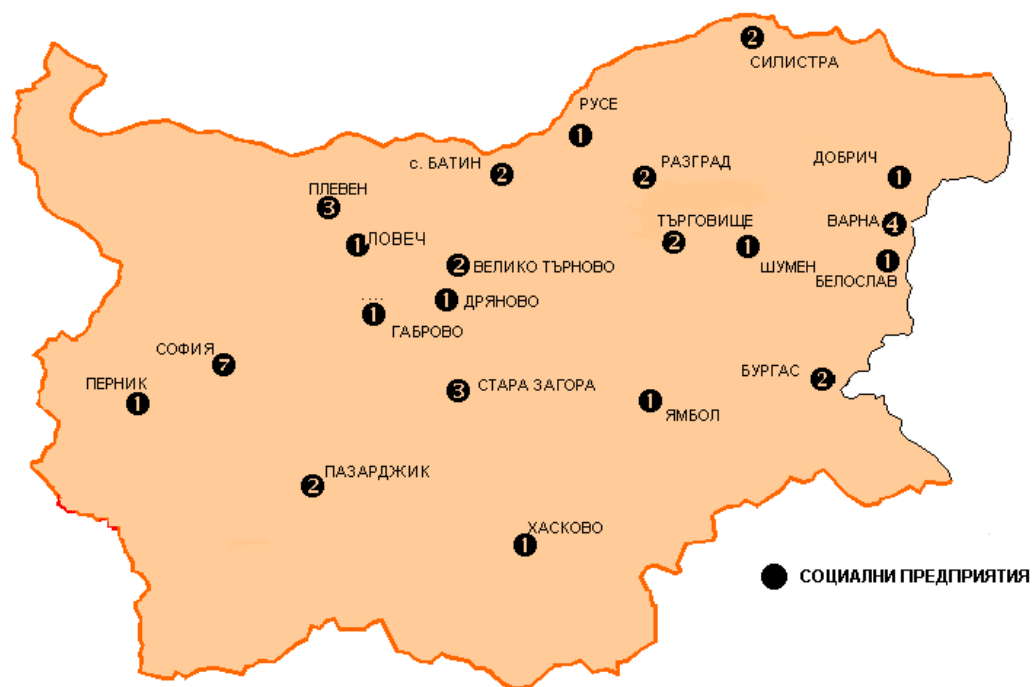
Map of the social enterprises in Bulgaria